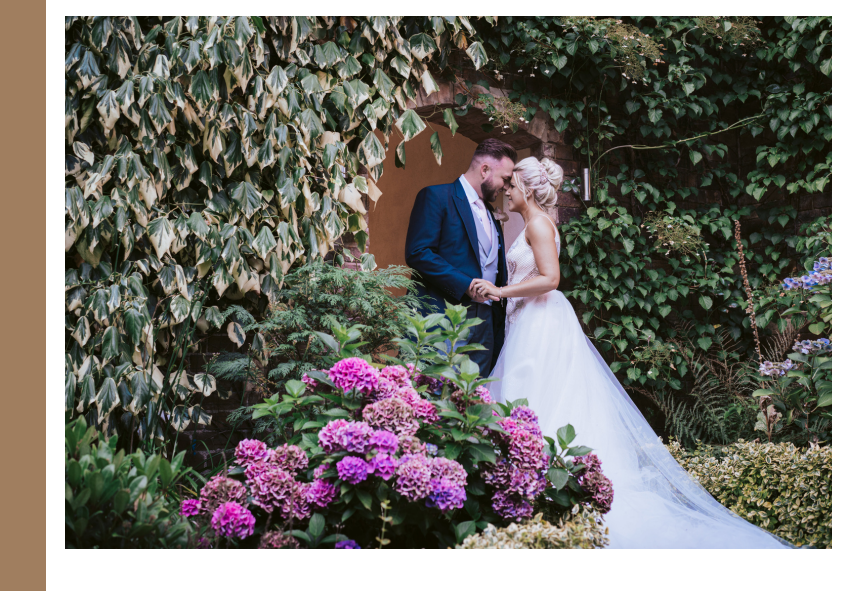
Your Luxury Exclusive Use Wedding Venue

WE WILL WORK WITH YOU TO BUILD THE BESPOKE WEDDING OF YOUR DREAMS